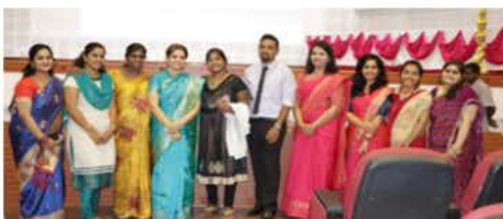
Faculty Participated In Research Program