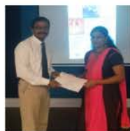
Faculty As A Judge For E-poster Presentation At Srm Dental College