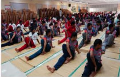
Yoga Training Session To Students