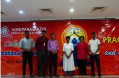
International Yoga Day – 21st June 2019

International yoga day was celebrated on 21st June 2019 which was organized by NSS unit and soft skill unit, APDCH. Yoga awareness and education as well as practical training session of different variants of essential yoga were taught to all the students of Adhiparasakthi Dental college and hospital by three experienced trainers from krishnamacharya yoga Mandhir.