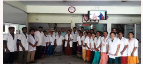
NSS Committee, APDCH

As a part of NSS annual event national dental hygiene month was conducted on 1st October 2019. This event includes NSS badge distribution to all the NSS staff volunteers, Slogan competition Prize distribution and oral hygiene pamphlet distribution to all the walk in patient at dental OPD to create dental awareness and good practice of oral hygiene.