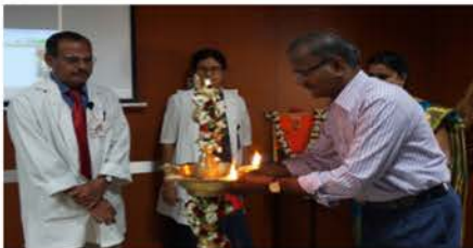
Periosakthi Chief Guests