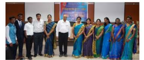
Periosakthi 2018 Organisers