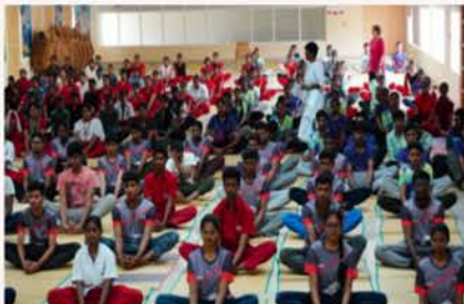
Yoga trainers effectively modulating the training sessions