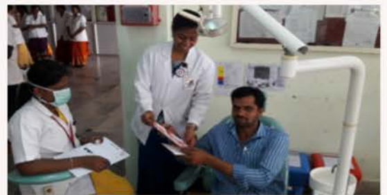
Distribution of oral hygiene pamphlets to patients by NSS staff volunteer