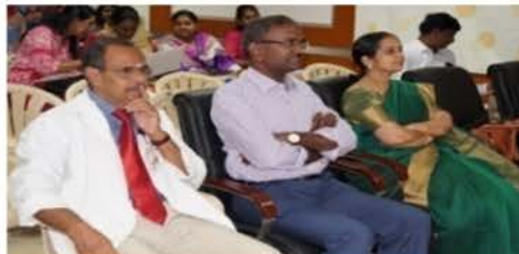
Periosakthi Chief Guests