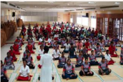
Meditation training as a part of essential yoga